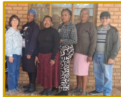
Magoba Primary School principal and teachers